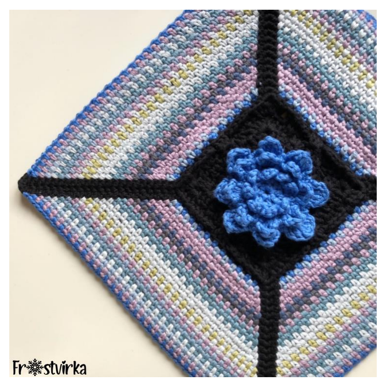
A Year of Roses - Design by Frostvirka Ellinor Widéen

Yarn: Viking Bamboo from Favoritgarner.se. 16 colours + a base colour, black or white.