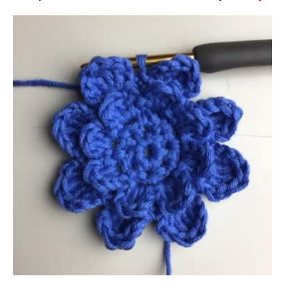
Round 6: Ch 1, (1 sl st in sl st, ch 4 behind the petal) repeat around, sl st in initial sl st. 8 sl st and 8 chsp

Round 5: (SI st in chsp, ch 2, 1 dc + 2 tr + 1 dc + ch 2 + sI st in chsp, 1 sI st in sc) repeat around, sI st in sc (the last st on round 4). 8 "petals"