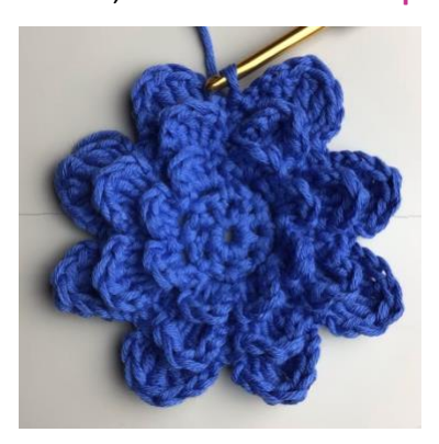
Round 8: Ch 1, (1 sl st in sl st, ch 5 behind the petal) repeat around, sl st in initial sl st. 8 sl st and 8 chsp

Round 7: Ch 1, (1 sl st in sl st, sl st + ch 2 + 1 dc + 1 tr + 1 dtr + 1 tr + 1 dc + ch 2 + sl st in ch sp) repeat around, sl st in initial sl st. 8 "petals"