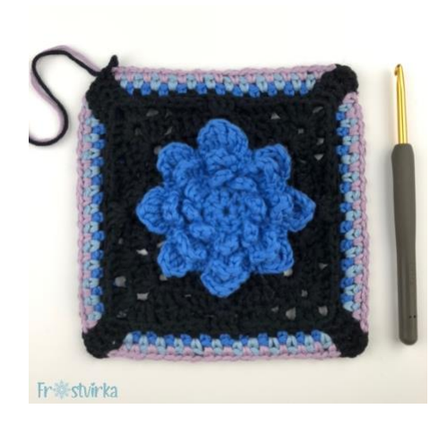
Day 4 – 31: As round 15 but repeat the parentheses one more time for each round.

Size efter round 15: approximately 14 x 14 cm