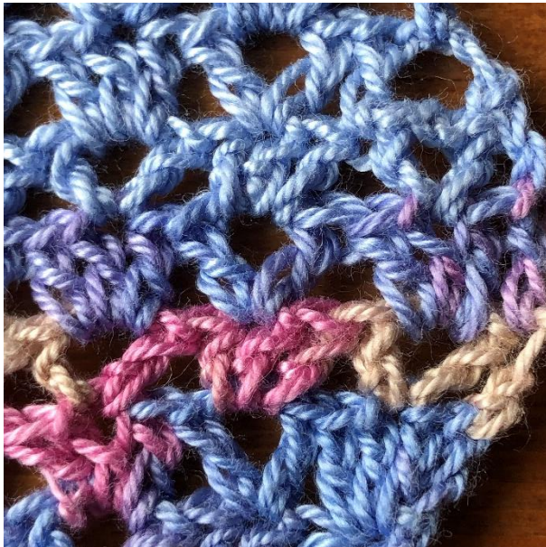
The first decrease, row 3, the row on the top in the photo.

Row 3: Ch 3, skip dc + chsp, dc in dc, skip dc, ( dc + ch 2 + dc in next dc, skip 2 dc, 3 dc in chsp, skip 2 dc) see photo, repeat to the end of the row, but the last time you only skip 1 dc, dc in ch 3.